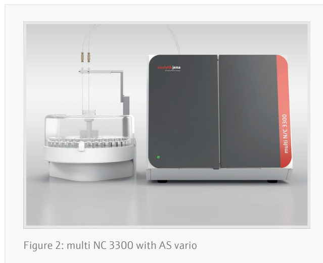
Figure 2: multi NC 3300 with AS vario

Calibration effort is reduced to a minimum using the EasyCal feature. This feature allows calibrations to be conducted with only one stock solution on a stable calibration level above or equal to one ppm while injecting different volumes. This way, the drinking water range can be calibrated from the sub-ppm range up to several ppm TOC.